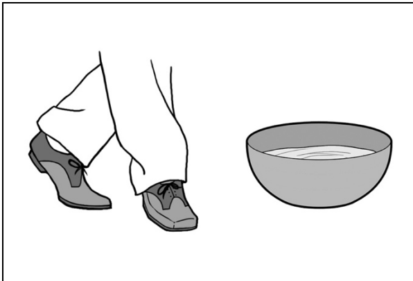
b. To mix the batter