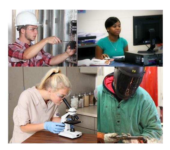
A well though out plan helps to keep students on TRACK

(http://education.ky.gov/CTE/ctepa/ Pages/default.aspx).