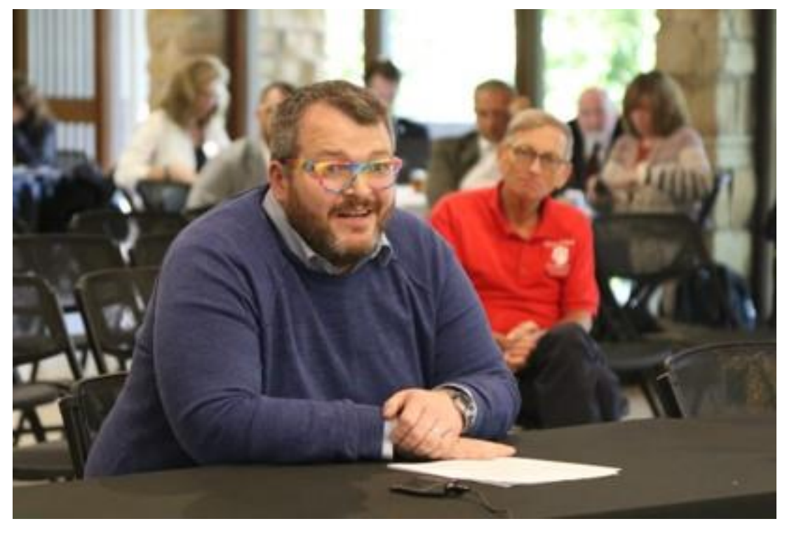
Video: 2022 Teacher of the Year Sabbatical Review to Kentucky Board of Education

"Love pervades education. It's why we are here. We don't just deliver content to the kids in the room. We sit with them, we get to know their struggles, their fears, their hopes and their ambitions, and we do everything in our power, sitting right beside of them, to get them to their wildest hope, to transform their lenses so that we might transform their lives. "