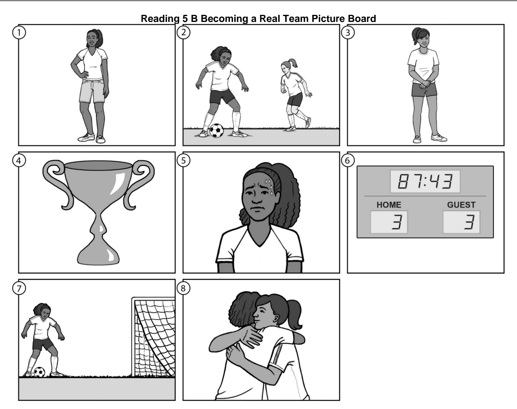
Alternate Kentucky Summative Assessment