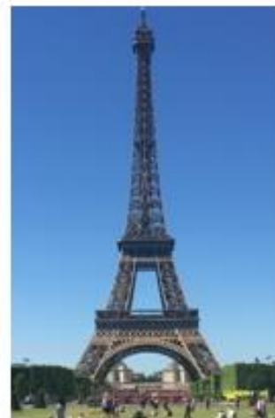
Eiffel Tower - Paris