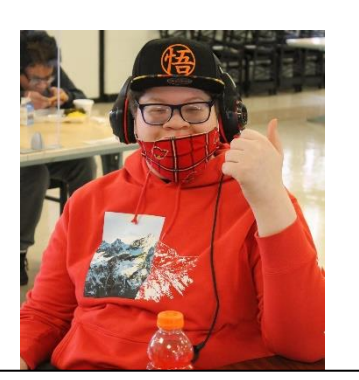
A high school boy is giving a thumbs up and smiling while sitting at a table in the cafeteria.

A young boy is using his white cane while walking in the hall with his teacher.