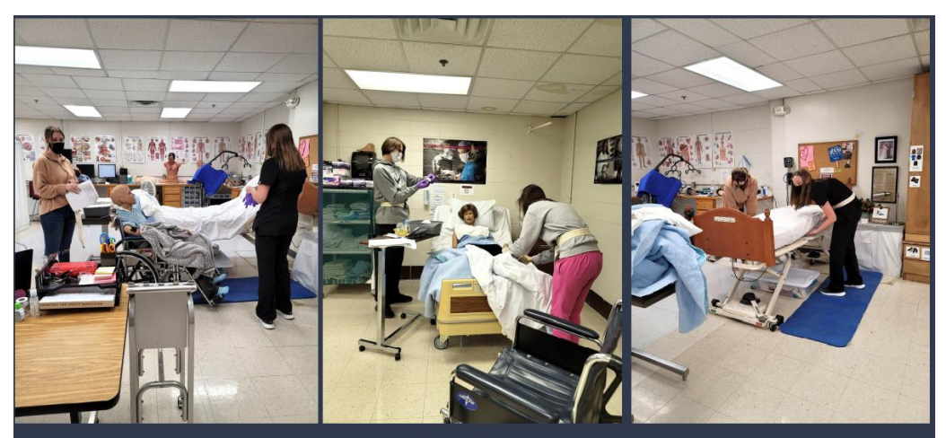
MNA Students Students were able to put their skills to the test during an in-class Nursing Home Simulation

instructor and students were able to effectively complete the required hours in the classroom setting, while adhering to COVID-19 guidelines.