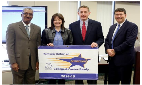
Ft. Thomas Independent