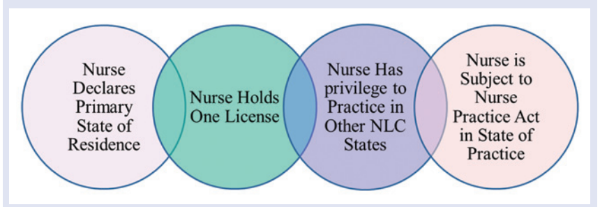
Figure 1. Mutual Recognition of Nursing License